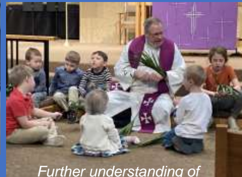
Further understanding of Palm Sunday is explained to the children